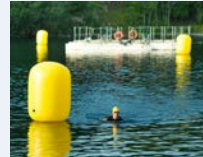
750M OPEN WATER SWIM COURSE