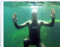
MONITORED WATER QUALITY