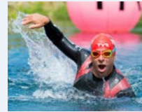
COACHING & DEVELOPMENT