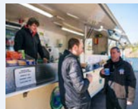
FOOD & DRINK CATERING