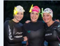
PACKED EVENTS SCHEDULE