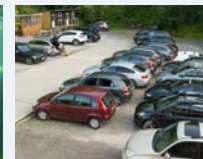
AMPLE PARKING & SHELTER