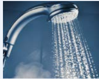
WARM CHANGING FACILITIES